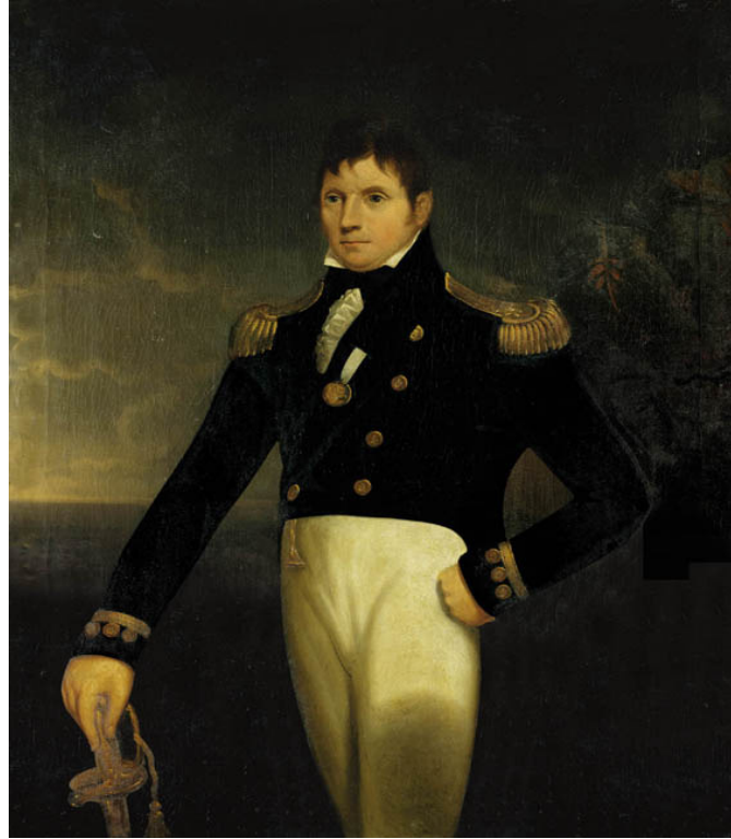
Captain Eliab Harvey (later Admiral Sir Eliab Harvey) (1758–1830)