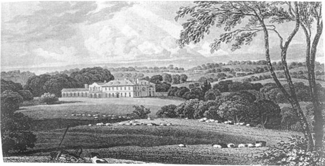
Rolls Park, Chigwell, Essex

A new comprehensive biography of the family that produced William Harvey (1578–1657) who discovered the circulation of the blood in 1628, and Admiral Sir Eliab Harvey (1758–1830) who commanded the Temeraire at the Battle of Trafalgar in 1805