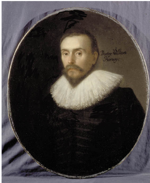
William Harvey MD (1578–1657)

Much of the profit from the merchant business was used to buy land and houses in several counties in southern England, including Essex, Hertfordshire, Surrey, and Dorset. Rolls Park at Chigwell, Essex, became the home of one branch of the family for nearly 300 years. In Georgian times the interior of the house was one of the most richly decorated in England.