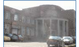
Brentwood Police Station

Jan 3, 2005 April 11, 2005 Jan 17, 2005 April 25, 2005 Jan 31, 2005 May 9, 2005 Feb 14, 2005 May 23, 2005 Feb 28, 2005 June 6, 2005 March 14, 2005 June 20, 2005 March 28, 2005 July 4, 2005