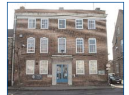
Epping Police Station

Jan 10, 2005 July 11, 2005 Jan 24, 2005 July 25, 2005 Feb 7, 2005 August 8, 2005 Feb 21, 2005 August 22, 2005 March 7, 2005 September 5, 2005 March 21, 2005 September 19, 2005 April 4, 2005 October 3, 2005 April 18, 2005 October 17, 2005 May 2, 2005 October 31, 2005 May 16, 2005 November 14, 2005 May 30, 2005 November 28, 2005 June 13, 2005 December 12, 2005 June 27, 2005 December 26, 2005