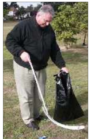
A volunteer litter-picker

Anybody can join in, just be at the village hall at 9.30 am on the first Saturday in every month and all the necessary sacks, tabards, gloves, litter pickers will be provided.