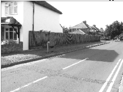
Is this what Elizabeth Drive will look like in the future?